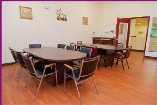
Our social rooms are great places for games, events and entertainment.

Participants spend their day with us socializing and enjoying fun activities with others. Every guest is treated with the utmost respect and sincerity by our compassionate and expert caregivers.