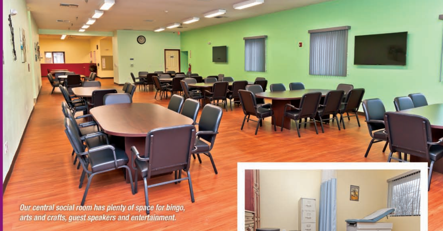
Our central social room has plenty of space for bingo, arts and crafts, guest speakers and entertainment.